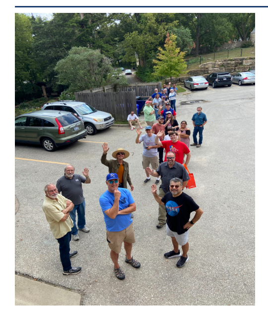
People lining up for the Sept 16, 2023 sale

There is quite a bit of history behind Audio-Reader's benefit sales of audio equipment, vinyl records, and more. The sale was nearing its 18th year when the Covid pandemic hit and everything shut down. Because of the support from you, our donors, for those 18 years, the audio benefit sale grew tremendously at the Douglas County Fairgrounds, drawing hundreds of audio fans each year. During the pandemic, the event transitioned to a series of online Facebook Live and Zoom sales, serving as a 'home-shopping network' to an eager audience. After returning to the office, the idea of inviting customers into the 'home' of Audio-Reader to shop audio goods was born and took off from there.