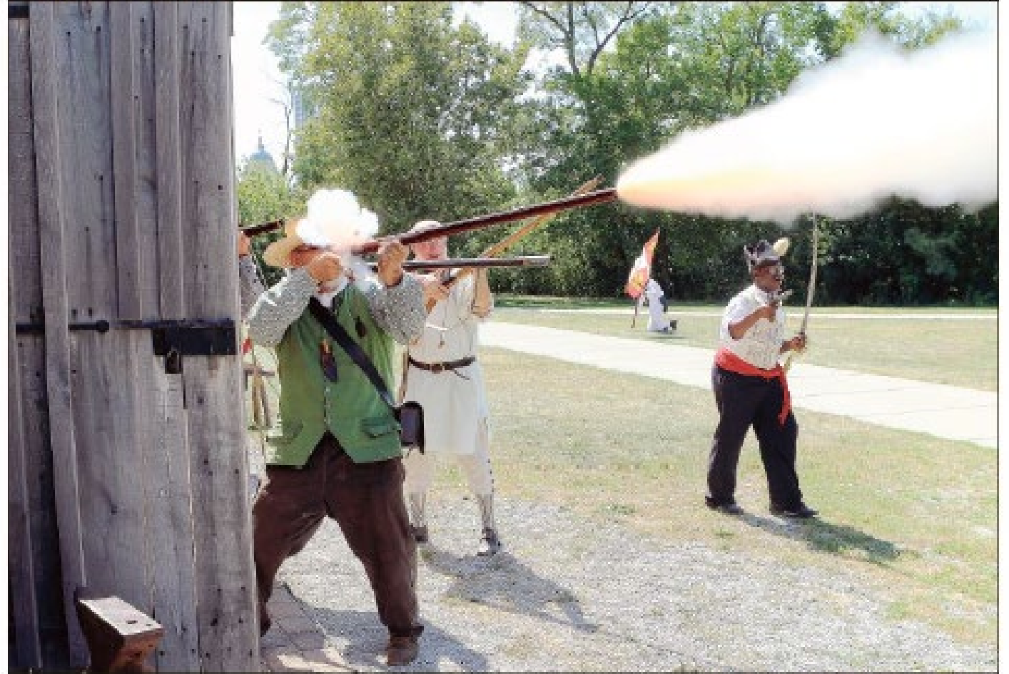
Reenactors emerge from the blacksmith shop and fire their muskets during a Napoleonic Days battle demonstration Sunday at the Old Fort.