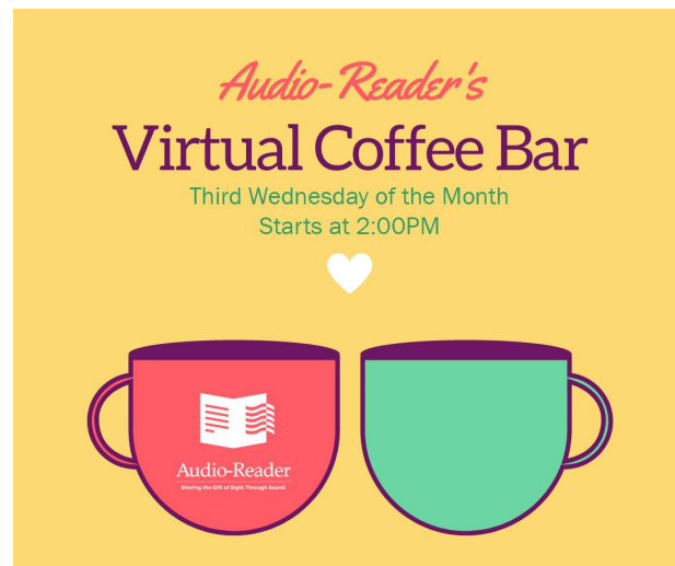
Image shows two coffee cups, one with the Audio-Reader logo.